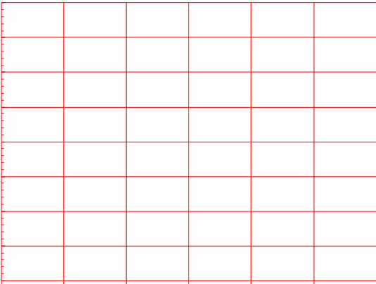
FIG.1: Maximum power dissipation versus RMS on-state current