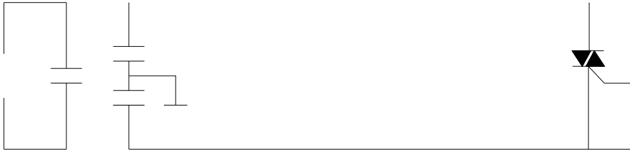
FIG.7 ÖTest circuit for inductive and resistive loads to IEC-61000-4-5 standards