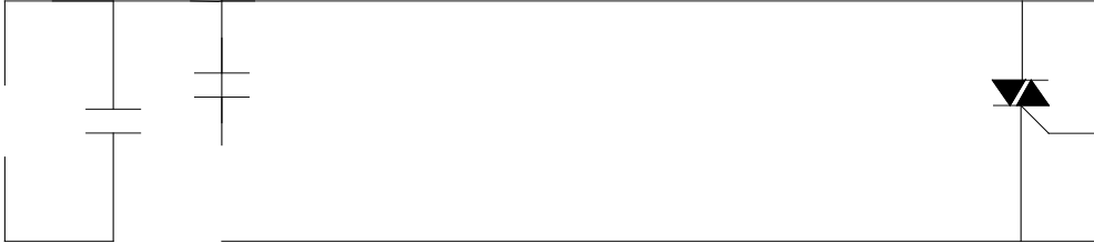
FIG.7 Test circuit for inductive and resistive loads to IEC-61000-4-5 standards