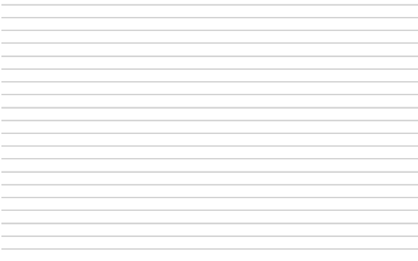
FIG.1 Maximum power dissipation versus RMS on-state current